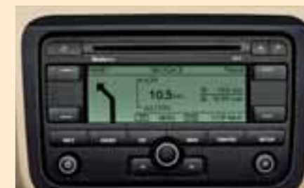
Navigation system with dynamic TMC module: enabling reception of traffic information, RDS-equipped AM/FM receiver, CD and MP3 players, connection to a CD changer, input jack for the mobile phone hands-free set.