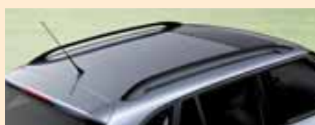
Roof railing (lengthwise), black