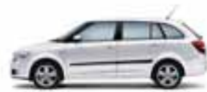
Candy White uni