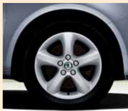
Antares alloy wheels 6.0J x 15" for 195/55 R15 tyres.