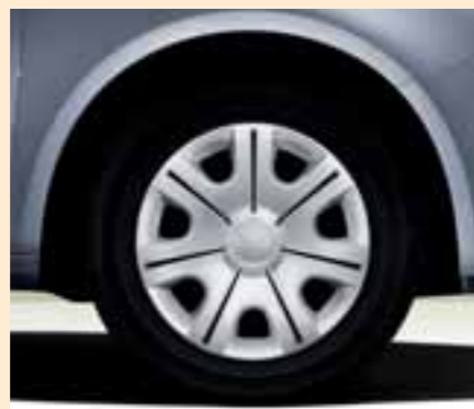
6.0J x 14" steel wheels for 185/60 R14 tyres with Tethys hub covers.