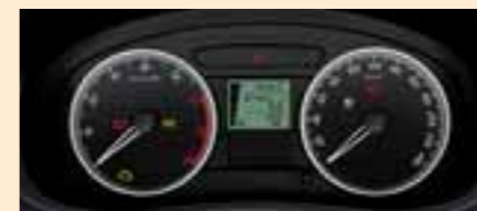
Instrument panel with on-board computer