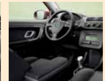
Pulse interior – sports seats b)