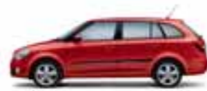
Corrida Red uni