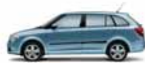
Satin Grey metallic