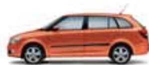
Tangerine Orange metallic