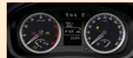
High-line instrument panel with MaxiDOT display