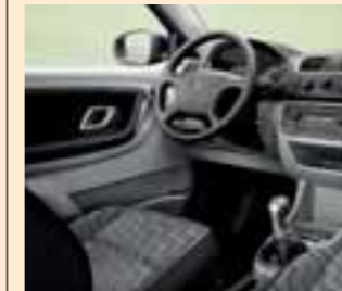
Style Grey interior (Onyx-Silver-grey dashboard)