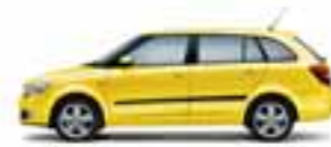
Sprint Yellow special