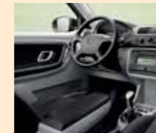
Floss interior – leather/artificial leather/ fabric a)