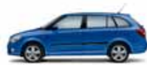
Dynamic Blue uni