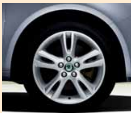
Atria alloy wheels 6.5J x 16" for 205/45 R16 tyres.