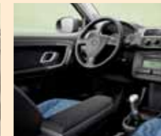
Style Blue interior (Onyx-Onyx dashboard)