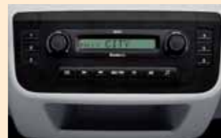
Radio Beat: AM/FM tuner with RDS, electronic encryption limiting the use of the radio to a specific car, CD changer control functions and input jack for the mobile phone hands-free set. Provided with audio jack.