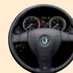
3-spoke sports leather steering wheel