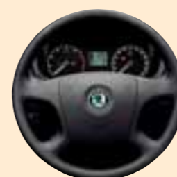
4-spoke steering wheel