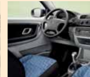
Style Blue interior (Onyx-Silver-grey dashboard)