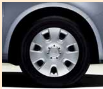
5.0J x 14" steel wheels for 165/70 R14 tyres with Draco hub covers.