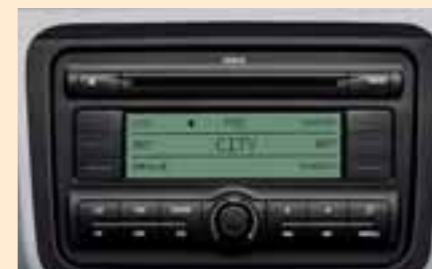
Radio Dance: same as Radio Beat, plus integrated CD and MP3 player, digital signal processor with an equaliser, and a large dot-matrix display conveying messages from the parking sensor. Provided with audio jack.