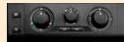
Climatic – air conditioning with automatic regulation and combi filter: automatic maintenance of preset temperature of the air inflow, manual regulation of air volume and setting of exhaust.