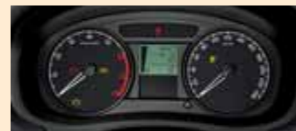
Basic instrument panel