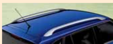
Roof railing (lengthwise), silver