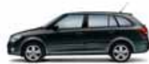
Black Magic pearl effect