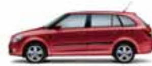
Flamenco Red metallic