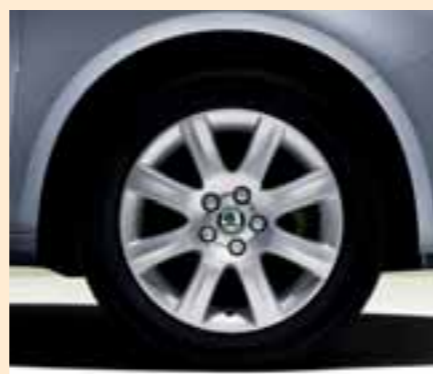
Line alloy wheels 6.0J x 15" for 195/55 R15 tyres.