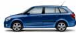
Storm Blue metallic