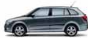
Anthracite Grey metallic