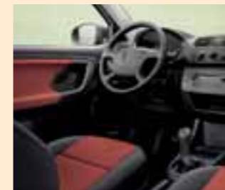
Stone Red interior