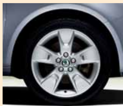
Bear alloy wheels 6.5J x 16" for 205/45 R16 tyres.