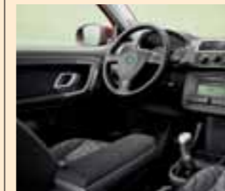
Style Grey interior (Onyx-Onyx dashboard)