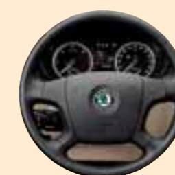
4-spoke leather steering wheel