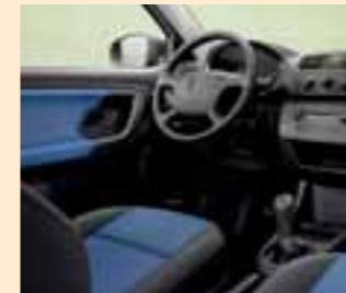
Stone Blue interior