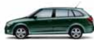
Highland Green metallic