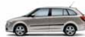
Cappuccino Beige metallic